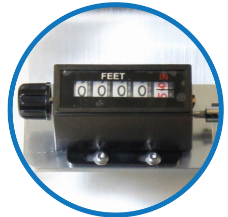
COUNTER AVAILABLE IN FEET & INCHES OR METERS & DECIMETERS