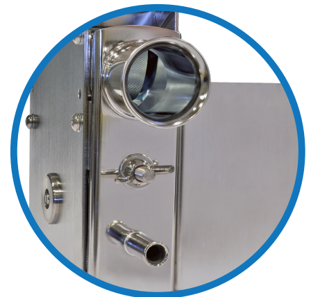
ADJUSTABLE LARGE & SMALL MATERIAL FAIRLEAD TUBE GUIDES